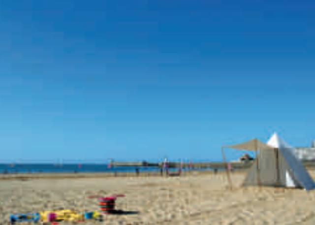
The Grande Plage at Les Sables d'Olonne, reputed to be one of the finest beaches in Europe.