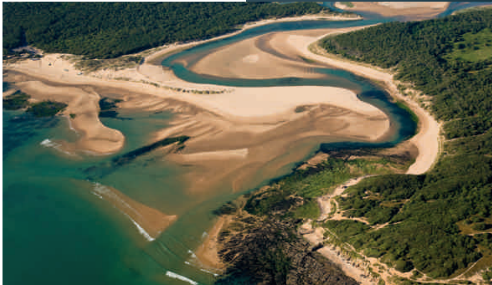
The "Veillon" at Talmont Saint Hilaire.