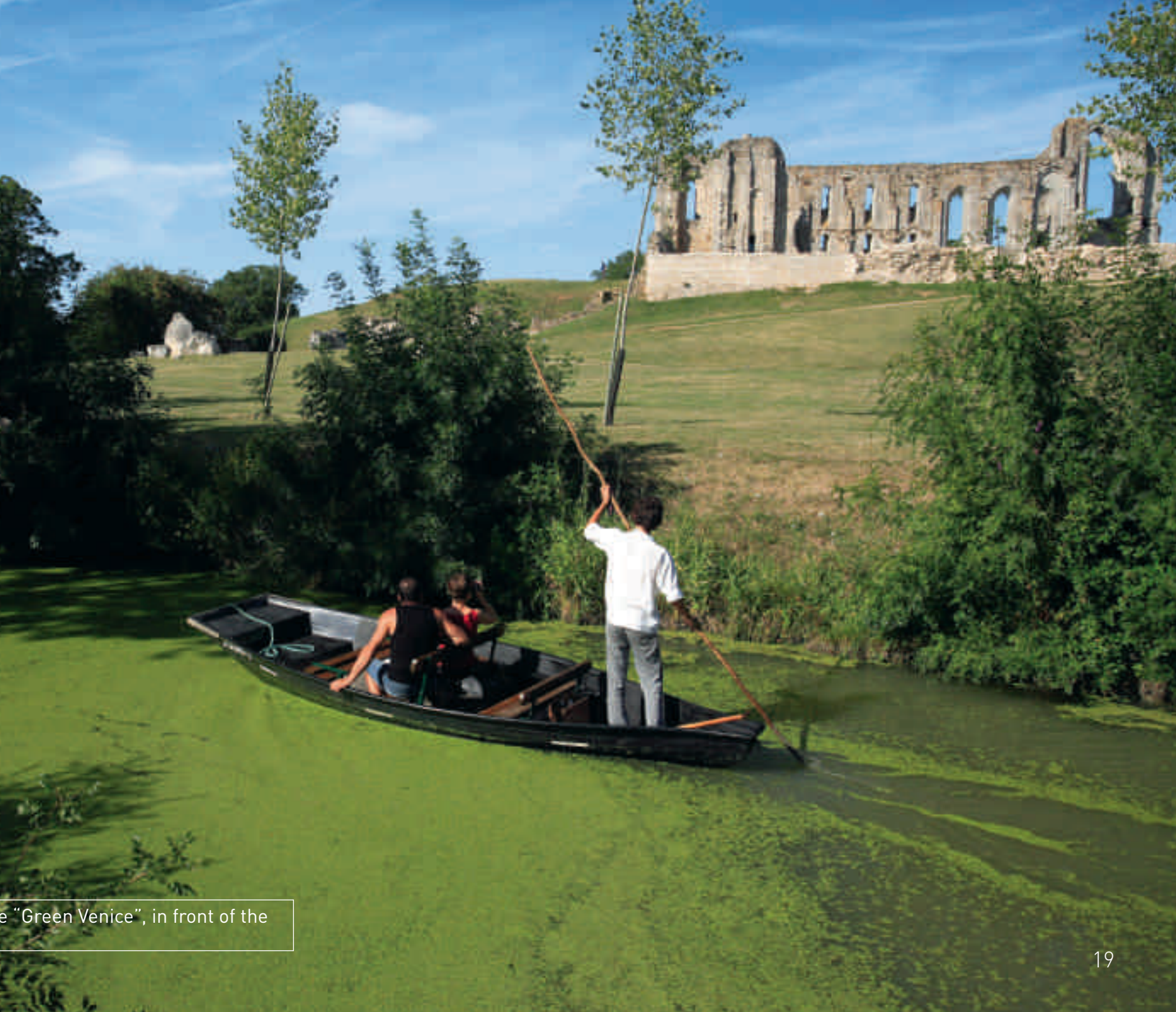
A boat ride along the "Green Venice", in front of the Maillezais Abbey.