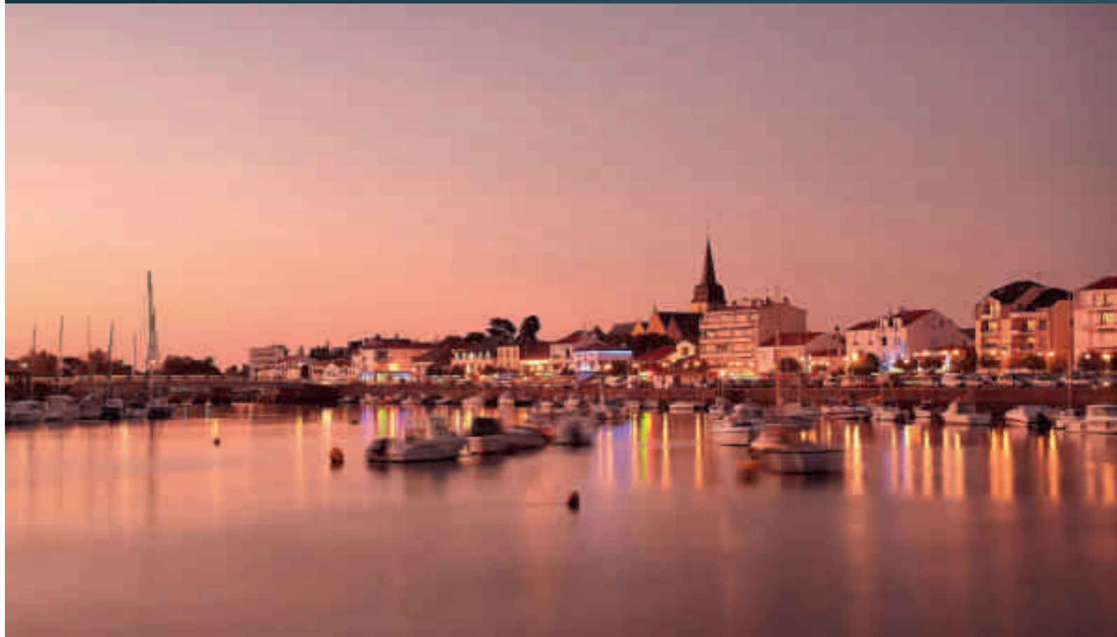
The fishing port of Saint Gilles Croix de Vie.