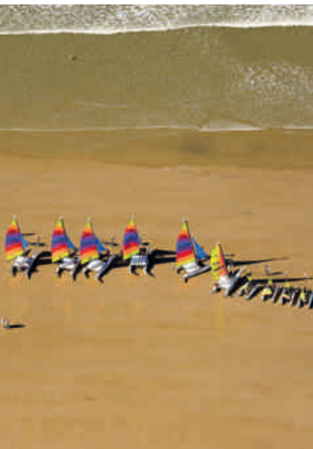
The 8 km stretch of beach at Saint Jean de Monts, a "station kid".