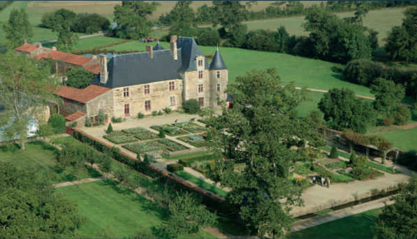
The Logis de la Chabotterie at Saint Sulpice le Verdon.