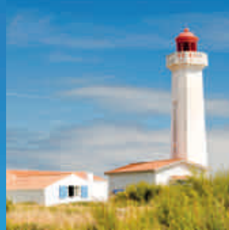
Between rocky coast and fine sandy beaches...