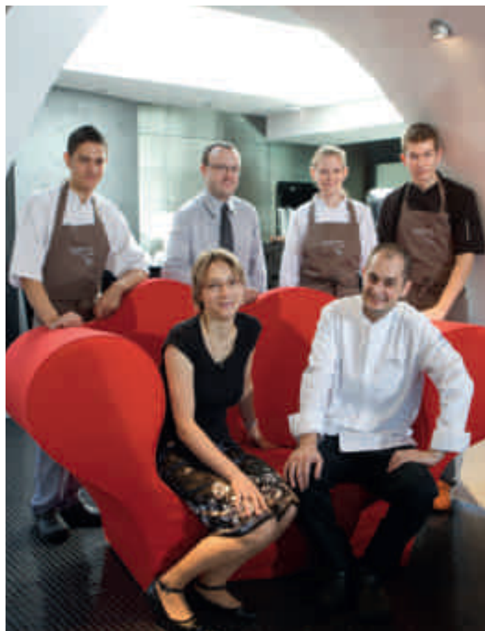
La Marine at Noirmoutier.