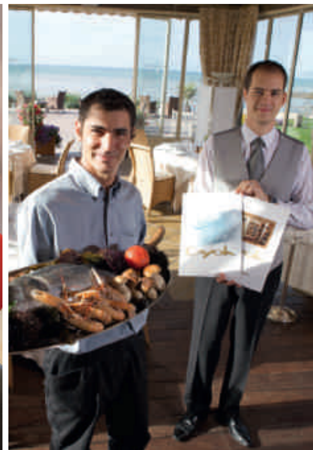
Cayola at Le Château d'Olonne.