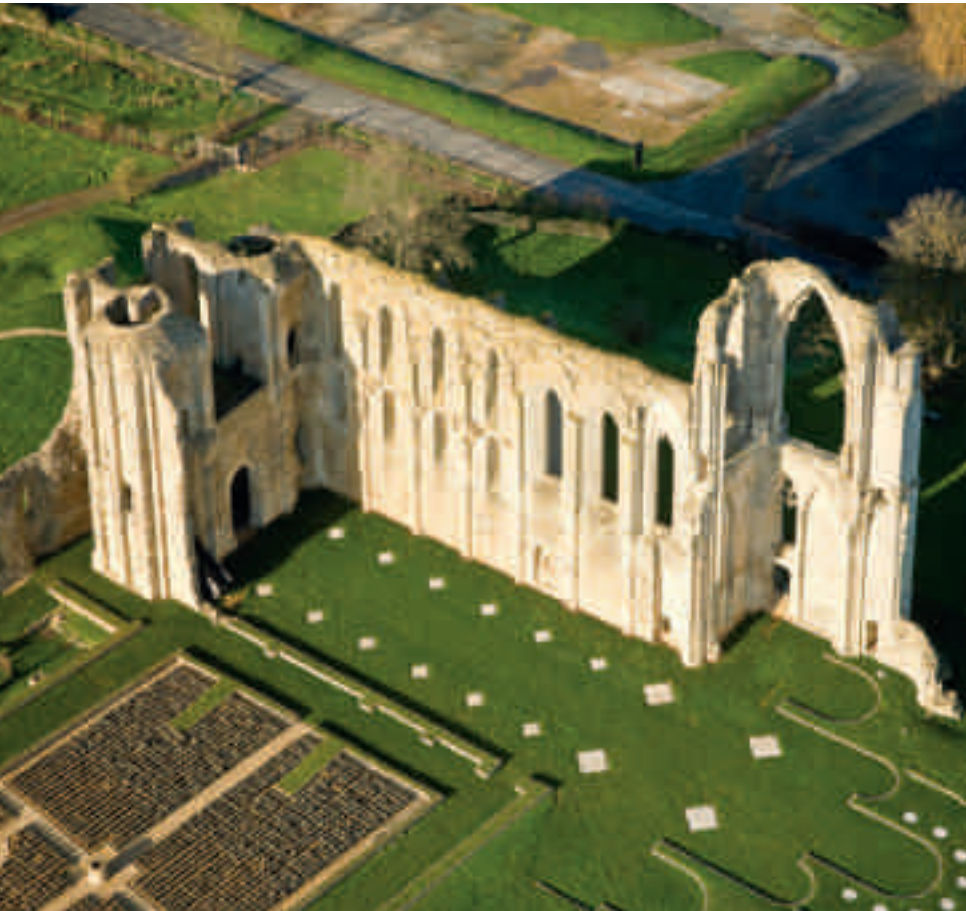
Abbey of Maillezais.

120 tourist attractions and cultural sites. More than 700 châteaux, country houses, castles, abbeys and medieval fortresses delete this.