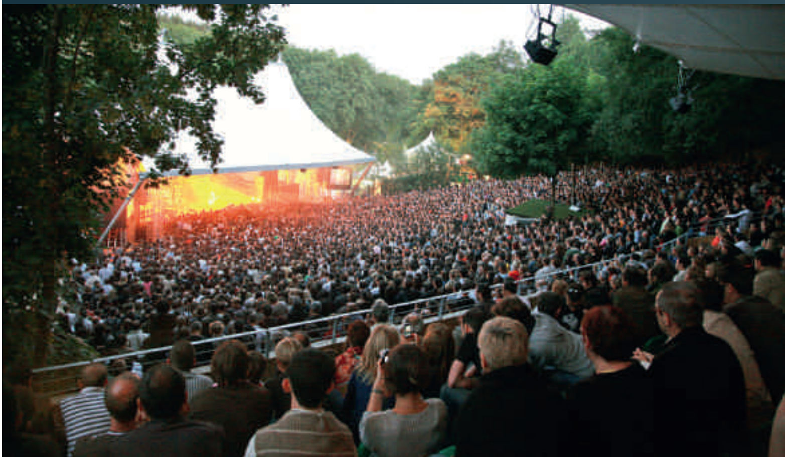
Poupet Festival at Saint Malo du Bois.