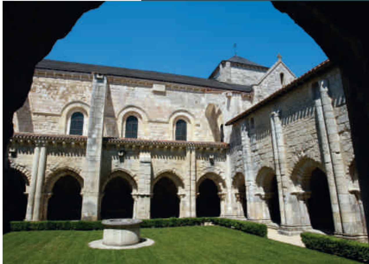
Abbey of Nieul sur l'Autise.