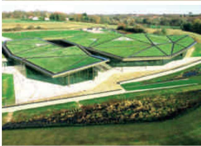
The Historial at Les Lucs sur Boulogne, a state-of-the-art museum.