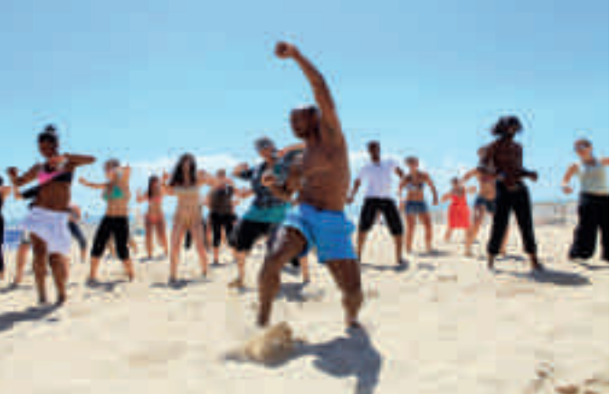
Salsa Swim Festival at Saint Jean de Monts.