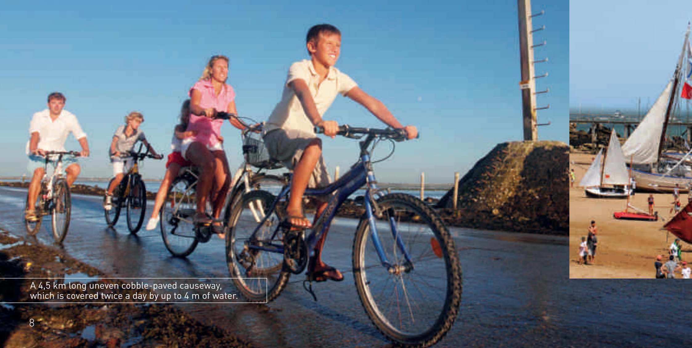
A 4,5 km long uneven cobble-paved causeway, which is covered twice a day by up to 4 m of water.