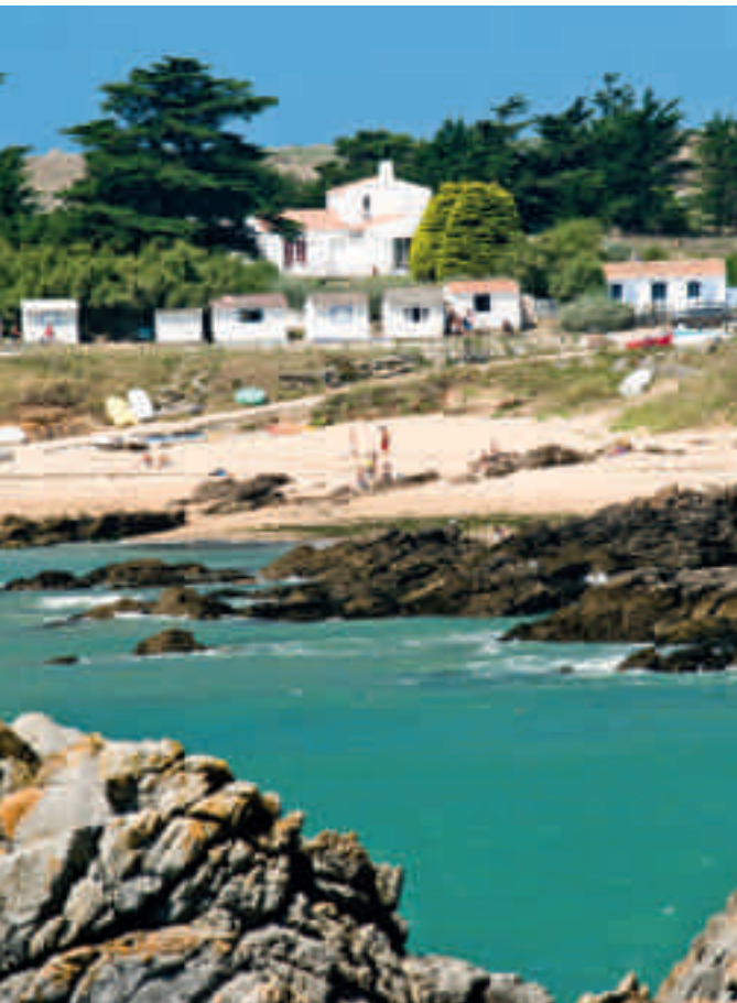
Rocky coastline at the Island of Yeu.