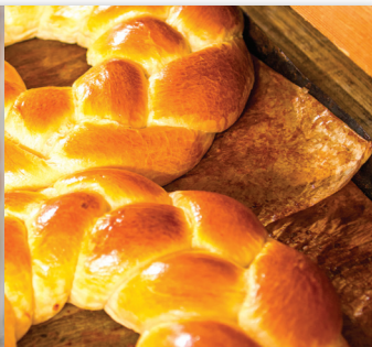
Brioche from «La Lutine»