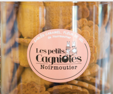
Les Petits Cagnioltes