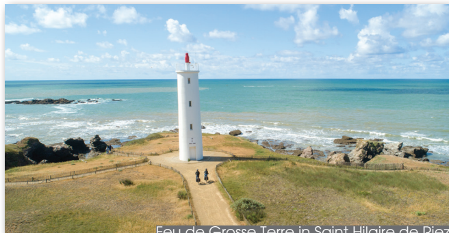
Feu de Grosse Terre in Saint Hilaire de Riez

The Vendée's architecture ranges from Romanesque churches and medieval castles to fishermen's cottages and tiny thatched farmhouses. The 12 th -century abbeys of Maillezaïs and Nieul sur l'Autise stand on the fringes of the tranquil " Venise Verte ", or " Green Venice ", a charming rural landscape in the heart of the Marais poitevin.