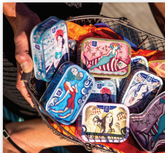
Sardine fins «La Perle des Dieux»

Creamy salted caramel or biscuits from Biscuiterie “Les Petits Cagnioltes” on the Island of Noirmoutier.