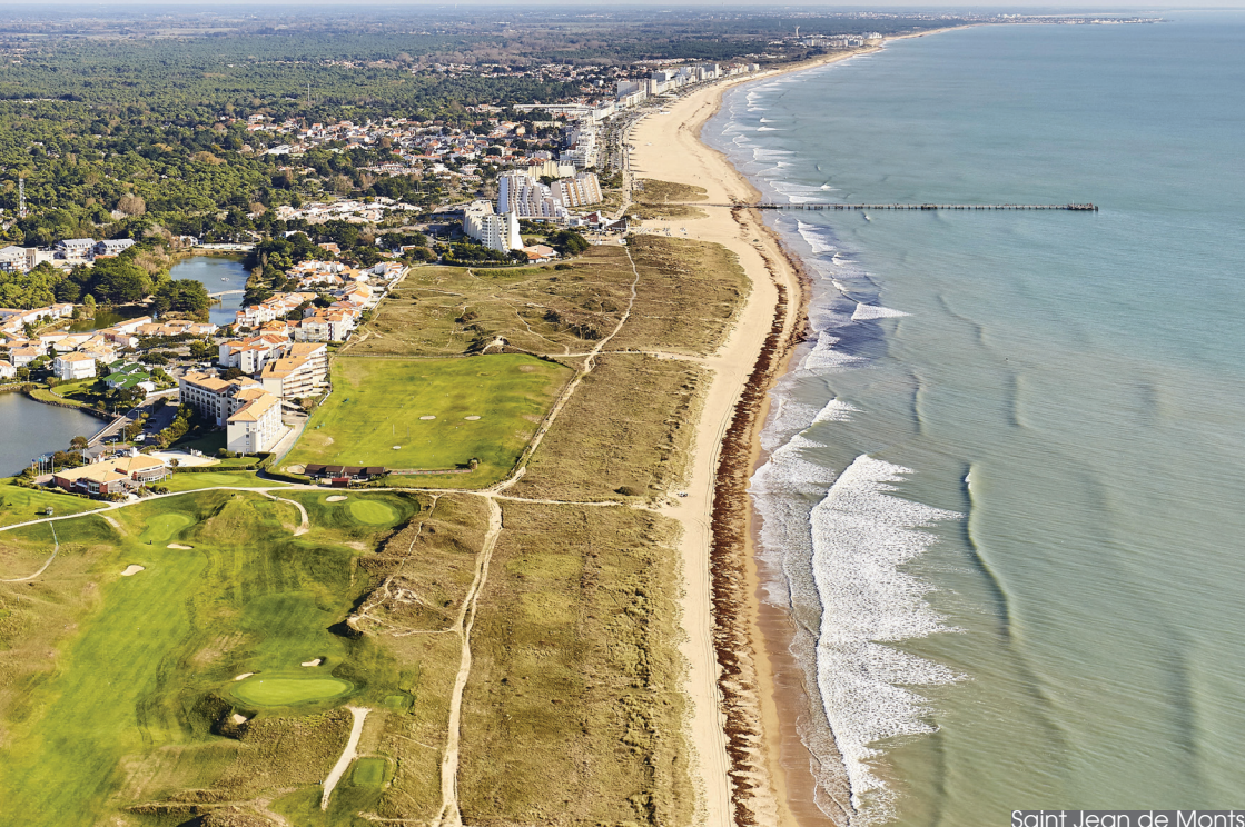
Saint Jean de Monts

First, and best-known, are those long (140 km), sandy beaches stretching as far as the eye can see, which characterise the Vendée's seaside resorts. These have long been family favourites for their safety and for the great variety of activities they offer.