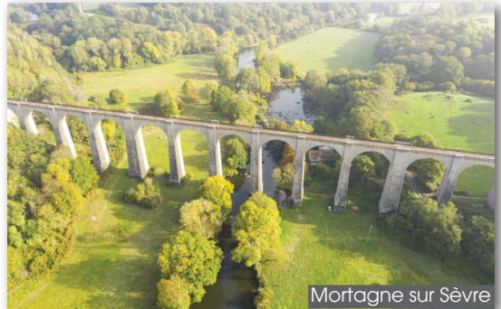
Mortagne sur Sèvre

Est-ce qu'on peut payer par carte bancaire ?