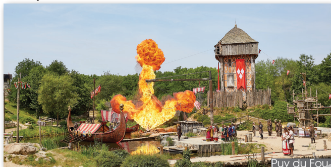
Puy du Fou®

For those who prefer a world without cars, it's easy to take to simpler modes of transport such as a horse, a bike, or simply one's feet. Today, 1,800 km of cycle paths lead to every corner of the Vendée , from Fontenay le Comte (Town of Art and History) to Mervent (legendary domain of the French fairy Mélusine), and from the Marais poitevin northward to the unmissable theme park of Puy du Fou® .